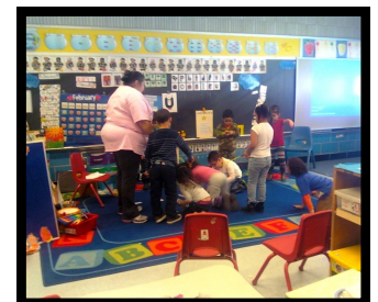
Pre-kindergarteners learning how to fish in Lawrence, based on GWL curriculum.

Watching how engaged the kids were was definitely a selling point on how effective Groundwork's curriculum is in Lawrence! Great job GWL!